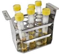
TR-16/19 BS-010406-FK rack

Test tube rack for \varnothing 30mm tubes, capacity 5 tubes. WxDxH: 155x90x112mm