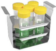
TR-5/30 BS-010406-KK rack

Test tube rack for \varnothing 30mm tubes, capacity 5 tubes. WxDxH: 155x90x112mm