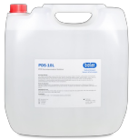
PDS-10L BS-040107-FK DNA/RNA Decontamination Solution 10l