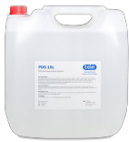
PDS-10L BS-040107-FK DNA/RNA Decontamination Solution 10l