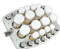
PRS-8/22 BS-010118-AK platform

48 tubes 10-16 mm diameter (1.5 ml-15 ml tubes).