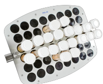
PRS-48 BS-010118-CK platform

14 tubes 20-30 mm diameter (50 ml tubes).