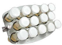
PRS-14 BS-010118-BK platform

14 tubes 20-30 mm diameter (50 ml tubes).