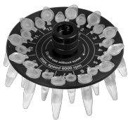
R-0.5/0.2 BS-010205-BK rotor

Rotor for 12 x 0.5 ml and 12 x 0.2 ml microtest tubes