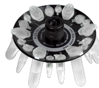
R-2/0.5/0.2 BS-010205-DK rotor

Rotor for 8 x 2/1.5 ml and 8 x 0.5 ml microtest tubes