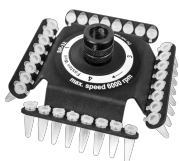
SR-32 BS-010205-FK rotor

Rotor for 2 x 8-section 0,2 ml microtube strips