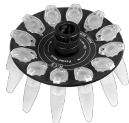
R-1.5 BS-010205-AK rotor

Rotor for 12 x 0.5 ml and 12 x 0.2 ml microtest tubes