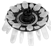
R-2/0.5 BS-010205-CK rotor

Rotor for 8 x 2/1.5 ml and 8 x 0.5 ml microtest tubes