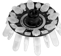
R-2/0.5 BS-010205-CK rotor

Rotor for 8 x 2/1.5 ml and 8 x 0.5 ml microtest tubes