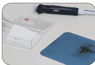
Beautiful Western blots every time