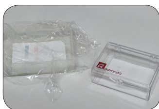
Save antibody and buffer by using the smallest tray that can hold your blot