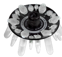
R-2/0.5/0.2 BS-010205-DK rotor

Rotor for 8 x 2/1.5 ml and 8 x 0.5 ml microtest tubes